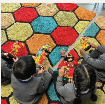
Year 1 - Equality Sharing, respecting others and celebrating different cultures through our play.