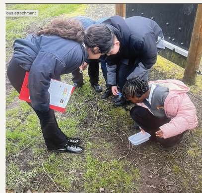
Year 4 - Care Showing our value of Care by exploring living things and their habitats with curiosity, respect and responsibility.