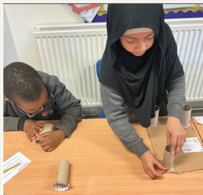
Year 3 - Thinking Flexibly Adapting ideas, trying different approaches and working creatively to solve problems.